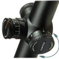
Adjust the side focus knob