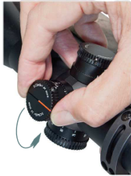
Correct alignment for zero point.

Turn the elevation knob a partial turn in a counter-clockwise direction until the Radius Bar is correctly aligned with scope axis and zero marks match. This setting will match the original zero point.