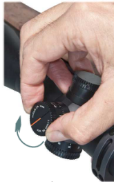
Point at which the knob stops turning.

Once the CRS shims are installed, the elevation dial will stop turning shortly past the original zero point when being returned (turning clockwise direction) from a temporary elevation adjustment.