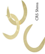
See CRS shim installation in the Bore Sighting and Final Range Sight-in sections.

Once the CRS shims are installed after sight-in, the elevation dial will stop turning shortly past the original zero point when being returned (turning clockwise direction) from a temporary elevation adjustment. The shooter can then turn the elevation knob a partial turn in a counter-clockwise direction until the zero reference and radius bar are correctly aligned—achieving the original zero point.