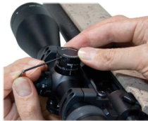
Align the windage turret cap.

Once the windage and elevation knobs are correctly indexed to the zero mark, temporary corrections can be safely dialed into the scope without worry of losing the original zero.