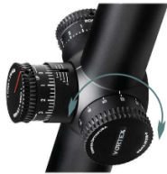
Turn Side Focus Knob

This Viper HS-T rifle scope uses finger-adjustable elevation and windage turrets with scales measured in minutes of angle (MOA). MOAs are unit of arc measurements which equal 1.05 inch for each 100 yards. Examples: 2.1 inches @ 200 yards, 3.15 inches @ 300 yards, etc.