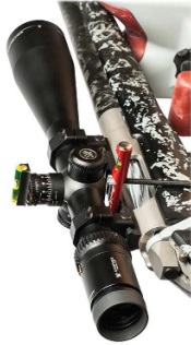
Using bubble levels to square the rifle scope to the base.