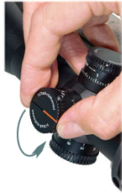
Correct alignment for zero point.