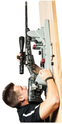
Visually bore-sighting a rifle.