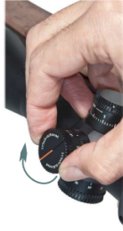
Point at which the knob stops turning.

Note: If re-zeroing at a future time, be sure to remove all CRS shims before sight-in.