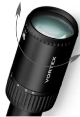
Rotate ring to adjust the reticle focus.

Vortex Viper PST riflescopes use a fast focus eyepiece designed to quickly and easily adjust the focus on the rifle's reticle. To adjust the reticle focus: