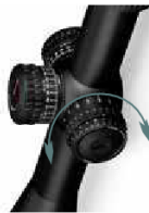
Side Focus Knob