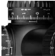
Aligning "0" marks.