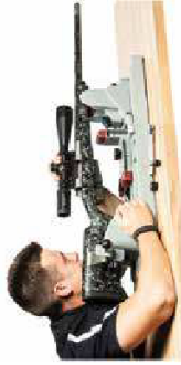
Visually boresighting a rifle.