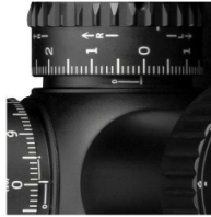
Aligning “0” marks.