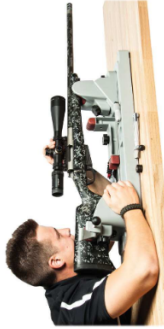
Visually boresighting a rifle.

After rifle is boresighted, do not re-tighten elevation zero stop lock screws on inner turret or replace the outer turret cap. This will be done after the final range sight-in is complete.