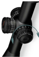
Side Focus Knob