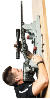
Visually boresighting a rifle.

After rifle is boresighted, do not re-tighten elevation zero stop lock screws on inner turret or replace the outer turret cap. This will be done after the final range sight-in is complete.